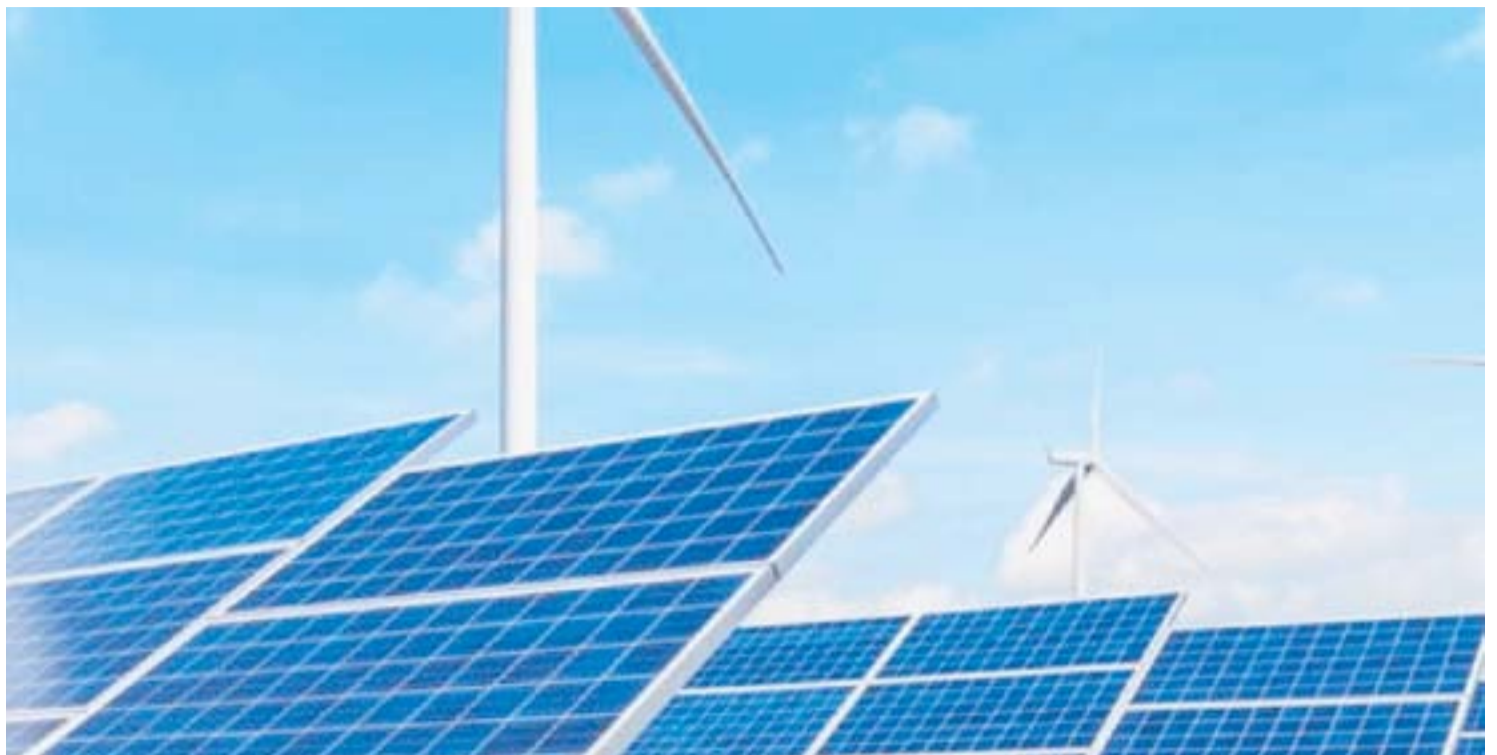
Stanwell join Anglo American in green energy deal.

"Many of the metals and minerals we produce – including steelmaking coal – are critical to supporting decarbonisation projects and the transition to renewable energy, as an