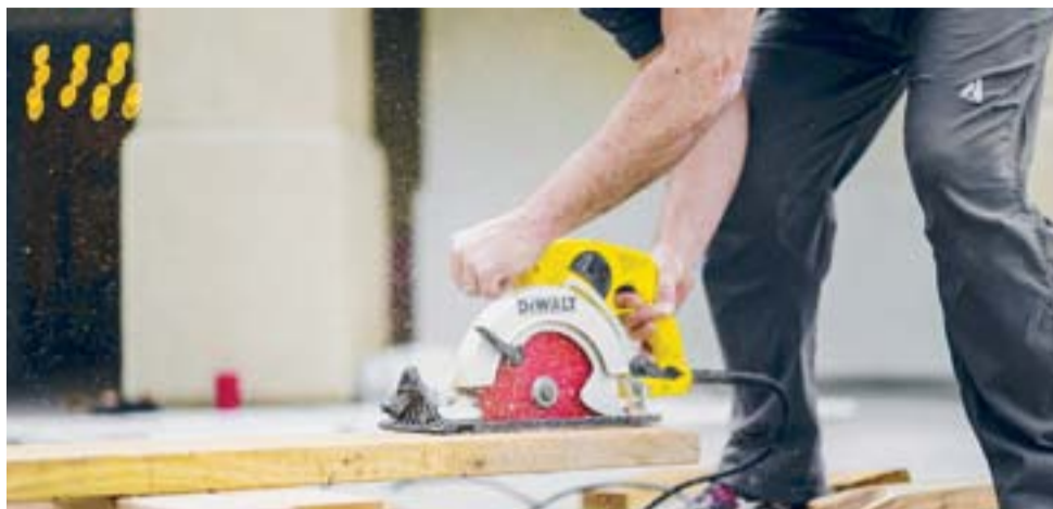
Occupations most in demand included healthcare professionals, technicians and trade workers.

This said, we do expect to see an increase