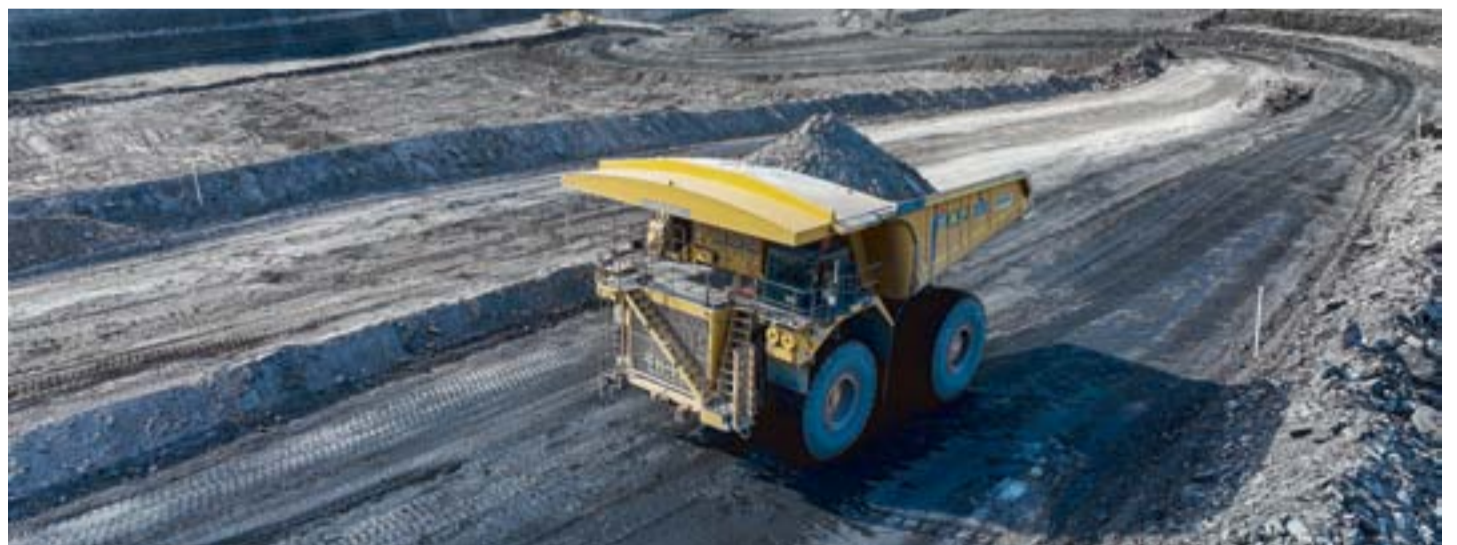
Operations at Bravus Mining and Resources' Carmichael mine which is now offering direct flights for workers out of Mackay.

"So we're really pleased to be able to offer direct flights from the city to provide new opportunities for the talented operators and tradespeople who live here, and create more value for the local coffee shops, real estate agents, car dealers and other businesses that