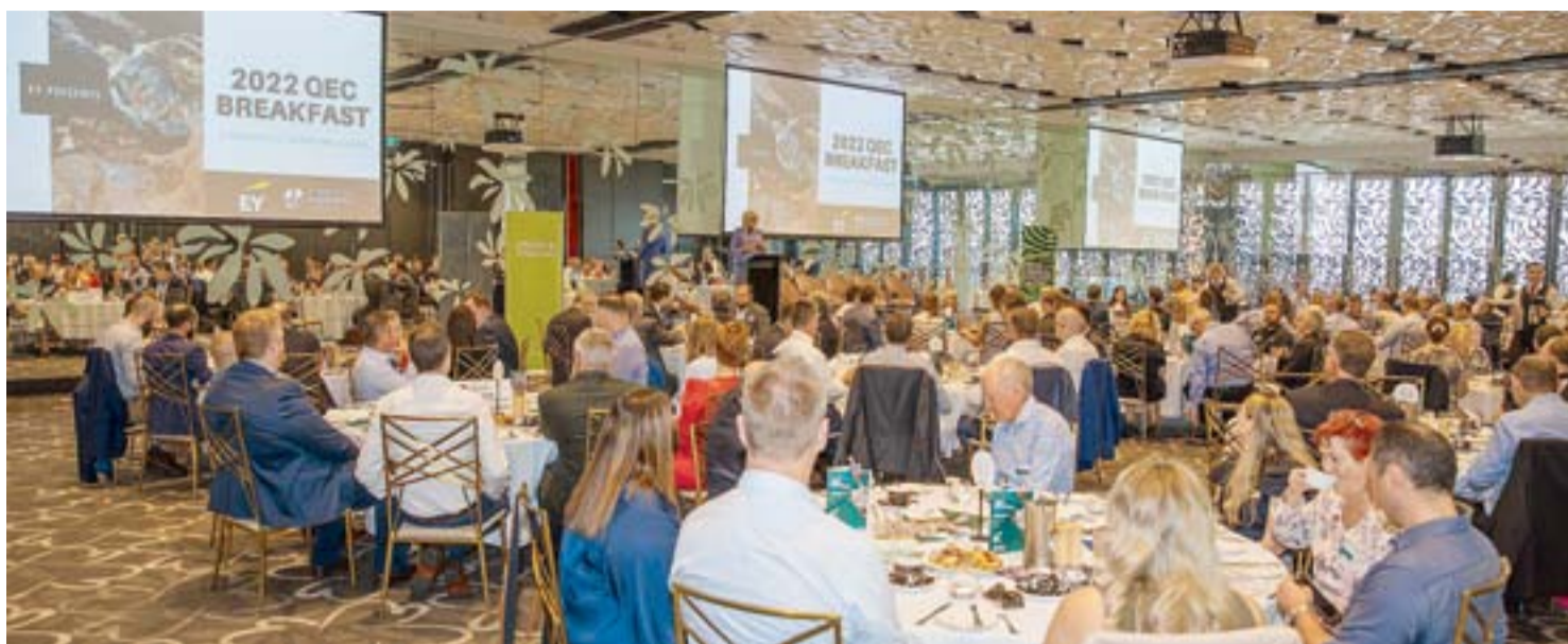
Industry representatives attend the 2022 QEC Breakfast and Exploration Scorecard Launch.

"Queensland's ability to deliver on its future potential in mineral and energy resources will depend on having a supportive policy frame-