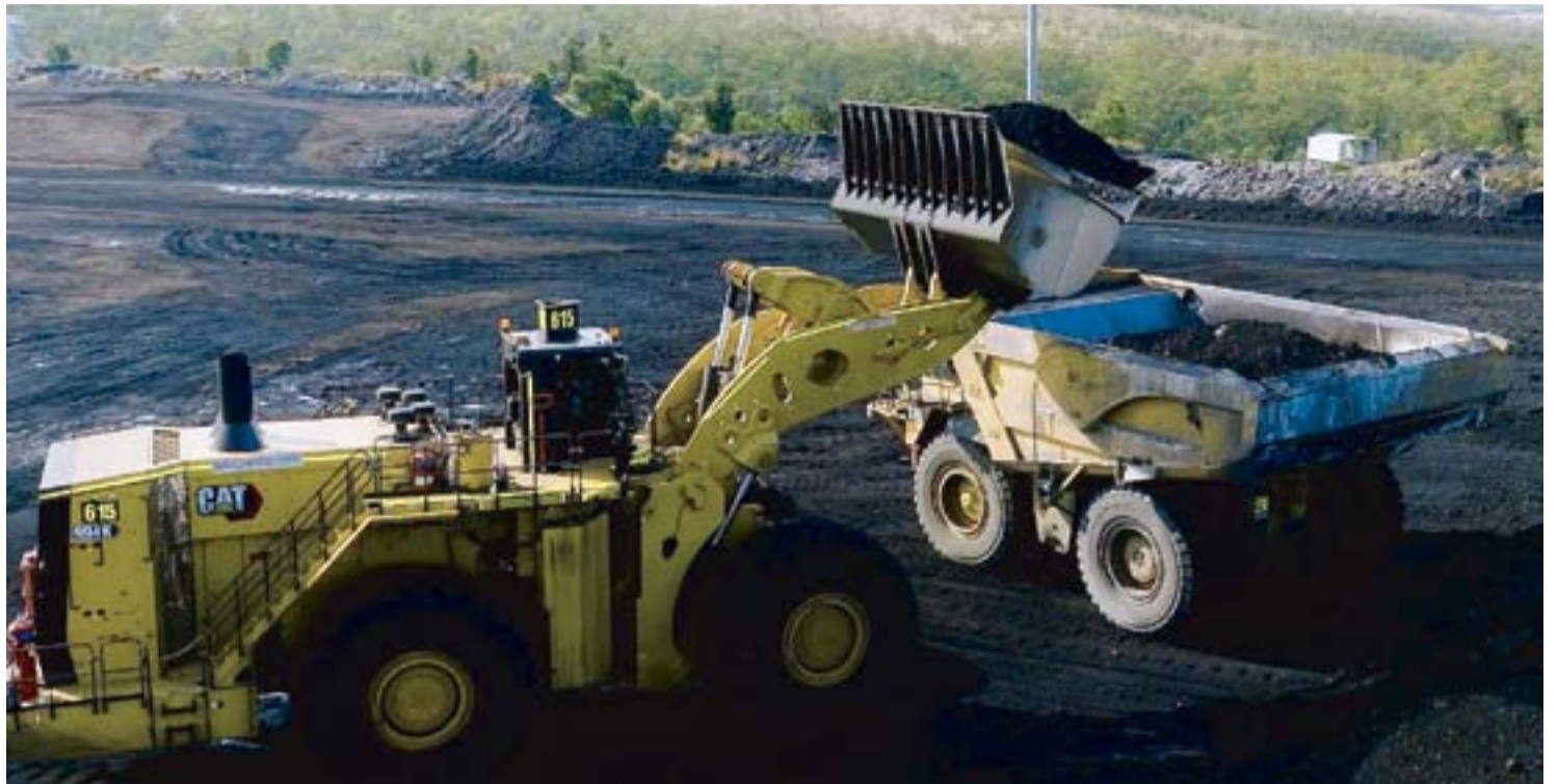
Batchfire resources recently retired the original 994 to bring in a brand-new Cat 994k.

"There's a huge difference in payload. It used to take us 10 buckets to load a 789 truck on the ROM. The new 994k, we can do that in four."