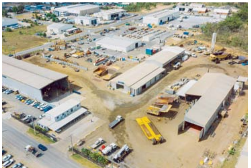
SMW in Rockhampton.