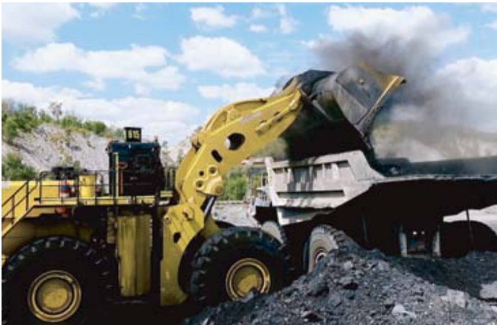
Batchfire Resources has seen 150 per cent improvement in material movement while minimising their carbon footprint with their new Cat 994K.